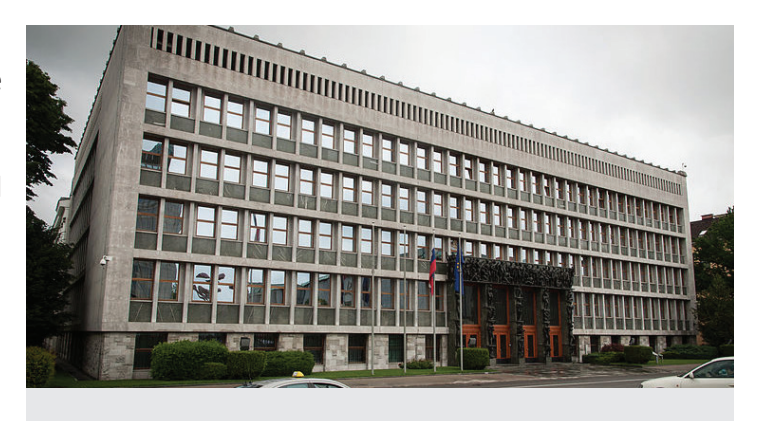
Slovenian Parliament Building, Ljubljana

The launch of a Slovenian Hub will mean that ELI hubs are active in five European countries: France, the UK, Austria, Germany and Slovenia.