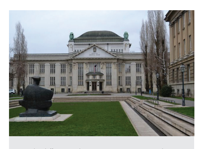
Hrvatski državni arhiv, Croatian State Archives

More details about the event will continue to be provided over the coming months, and registration will be open in the late spring. Please try to accommodate these dates in your diaries; this year's Conference promises to be of a very high calibre!