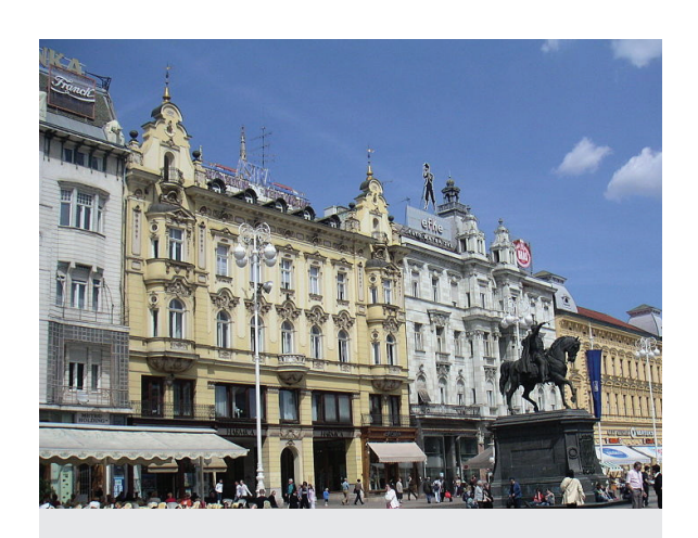
Trg bana Jelačića, Zagreb's main square