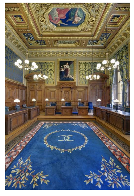
▲ Court room of the Commercial, financial and economic chamber

However, it had not yet had the opportunity to rule on non-European Community private international law, which represents a higher volume of cases than European Community Law-related litigation. In the ruling of the court of appeal